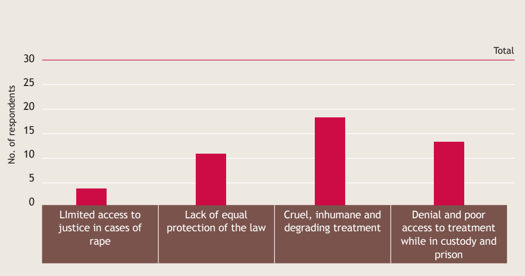
Figure 2: Human rights violations by law enforcement officers

Because sex work in Kenya is generally perceived as criminal and hence highly stigmatised, sex workers are exposed to high levels of harassment and violence by law enforcement officers. Experiences shared by participants in this research, are representative of those of many sex workers in Kenya who suffer at the hands of law enforcement officers.