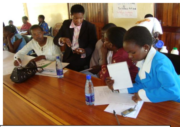
Participants during NEPHAK PwP training