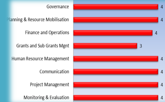
Figure 2. 2013 Rapid OCA results